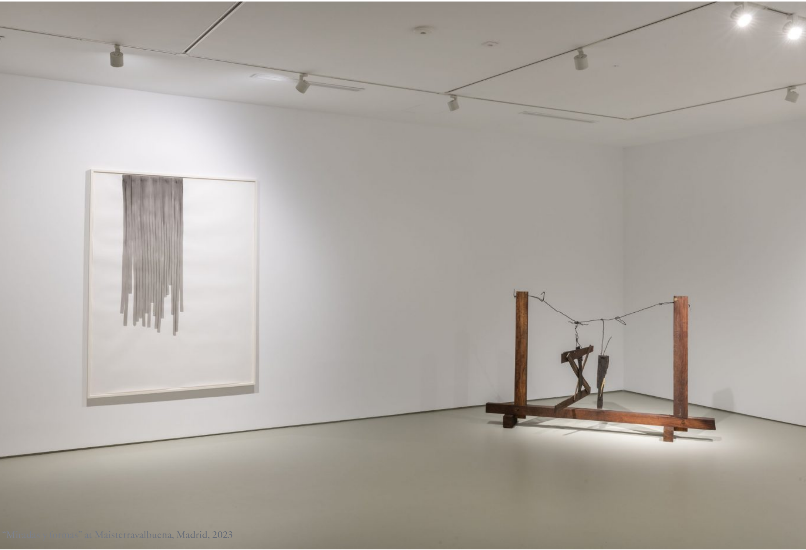
“Miradas y formas” at Maisterravalbuena, Madrid, 2023